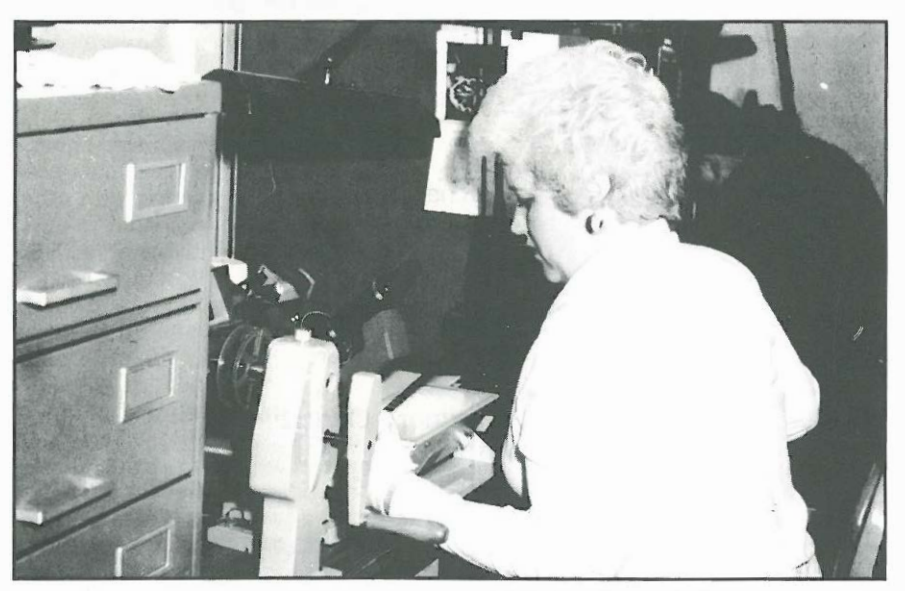
All of the historical documents at the Simpson Historical Research Center have been microfilmed, with duplicate films deposited at the National Archives and the Office of Air Force History. Here, a technician reviews film for flaws.

Special collections complement the unit histories. Among them are historical monographs; end-of-tour reports; joint and combined command documents; aircraft record cards; and materials from the US Army, British Air Ministry, and the German Air Force. The Center also houses the personal papers of key re-