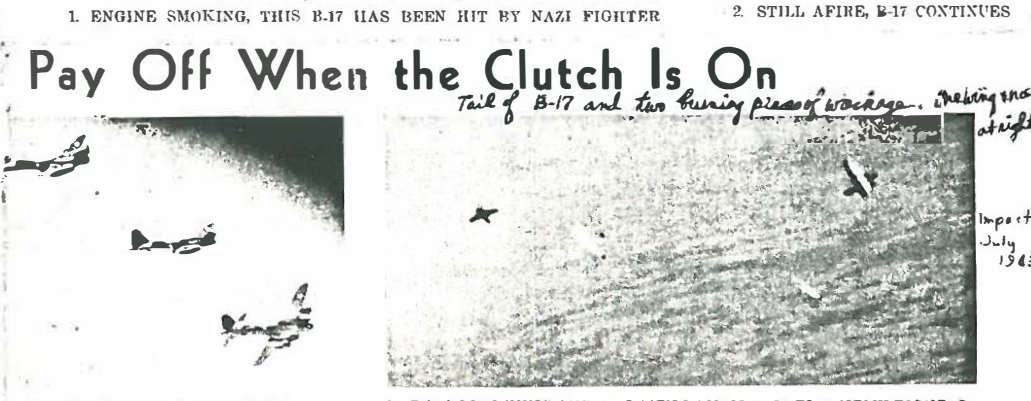
3. B-17 LOSES WING AND TWO MEN BAIL OUT. LEFT: ENEMY FIGHTER