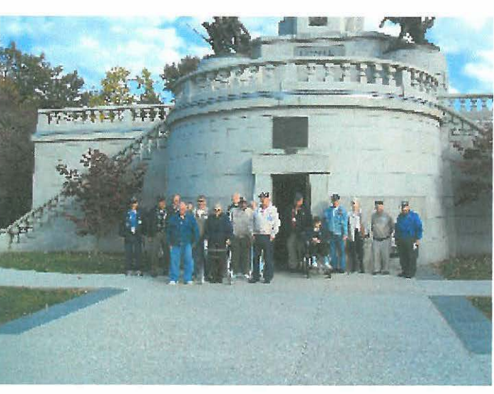
Veteran members of the 99<sup>th</sup> in front of Lincoln's tomb.