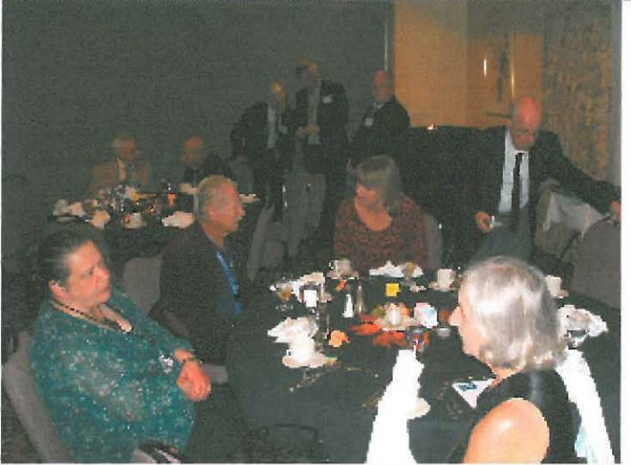
Members of the 99<sup>th</sup> BGHS enjoy dinner at the banquet.