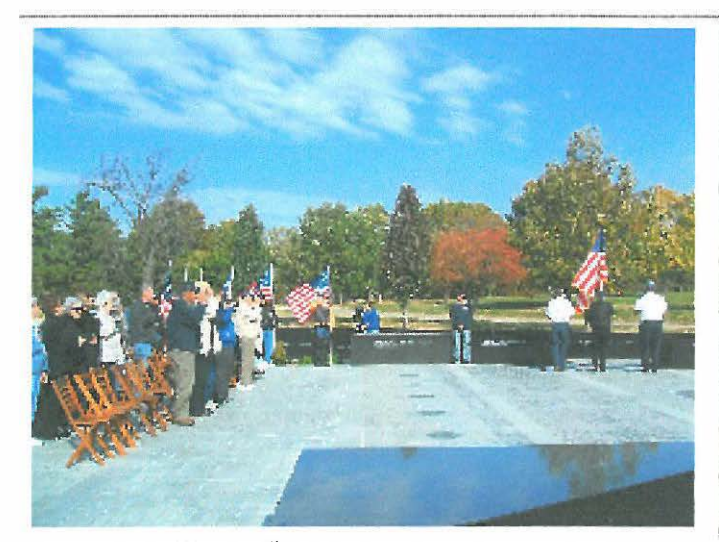
Members of the 99<sup>th</sup> BG salute the flag at the memorial ceremony held at the Springfield WWII memorial.